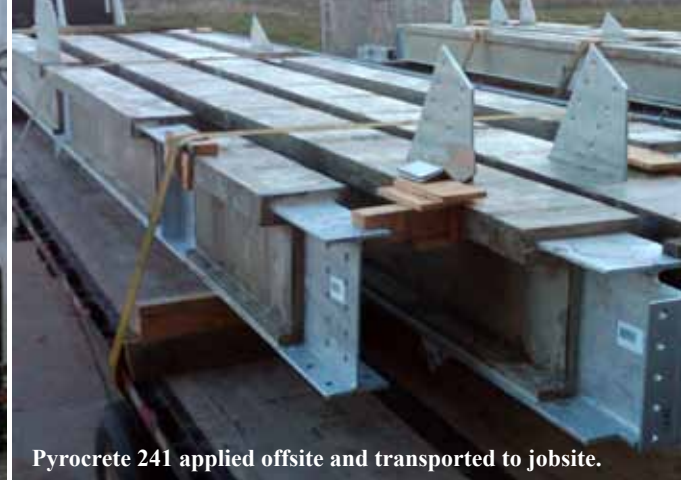
Pyrocrete 241 applied offsite and transported to jobsite.