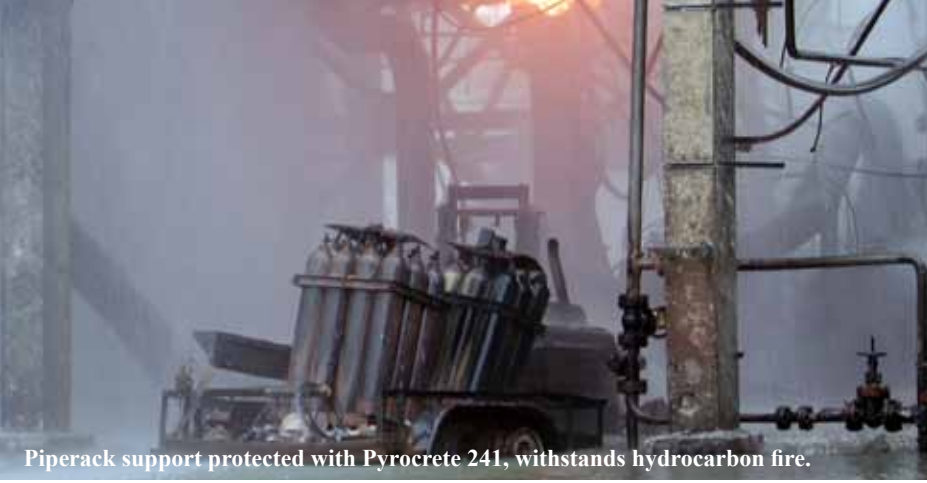
Piperack support protected with Pyrocrete 241, withstands hydrocarbon fire.